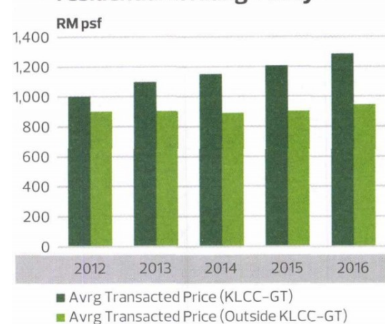
Performance of high-rise residential in Klang Valley