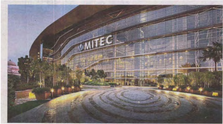
MITEC cost RM628mil to build and was designed to meet the demands of the city's growing MICE industry. — Bernama