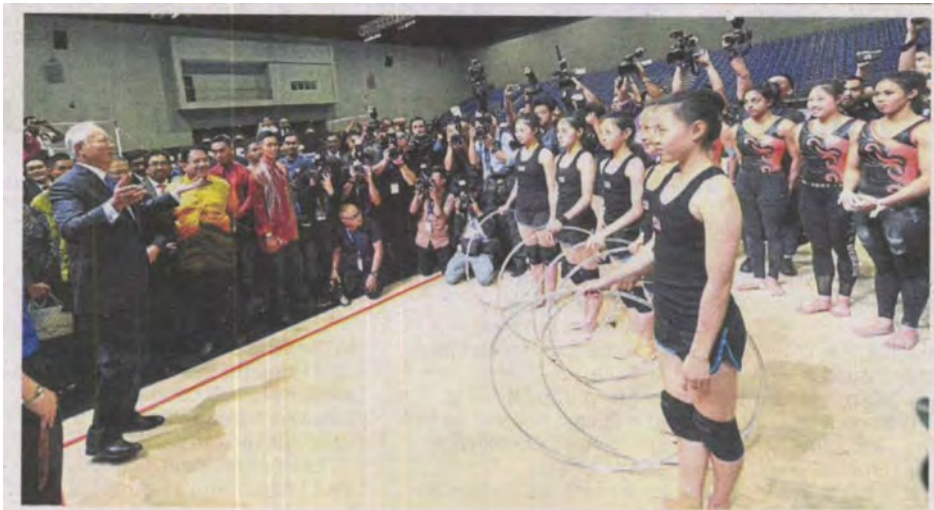
Najib (left) showing support to the national gymnastic team.