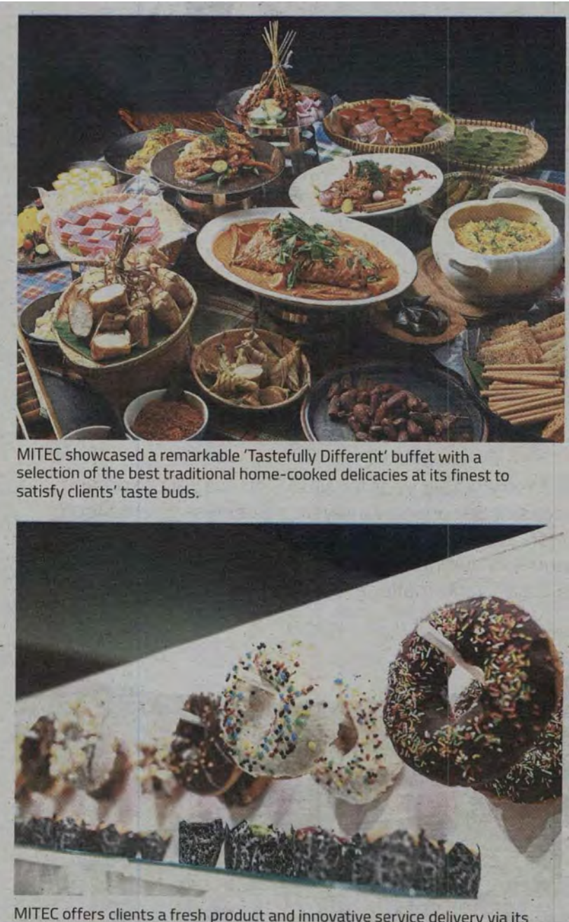
MITEC offers clients a fresh product and innovative service delivery via its creative culinary options.